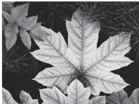
Leaf, Glacier Bay National Monument, Alaska, Portfolio Four: What Majestic Word, In Memory of Russell Varian (1940-63), 1963.