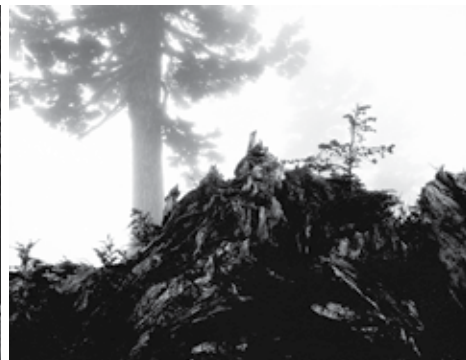
Tree Stump and Mist, North Cascades, Washington (IV of XII from Portfolio Seven), 1976.